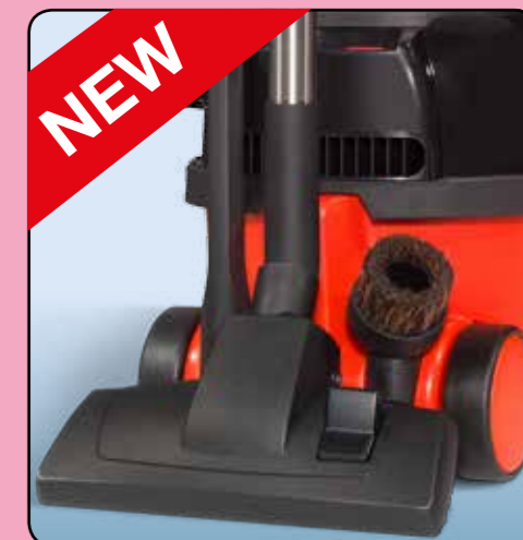
On-board tool storage