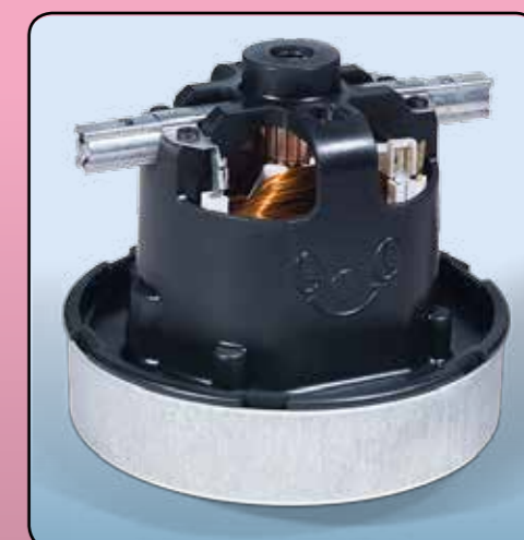
Numatic high efficiency longlife motor