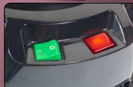
On / Off power indicator