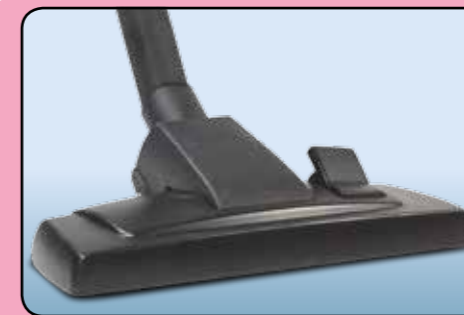
ProFlo high efficiency combi floor tool