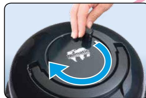
10m cable rewind and storage system