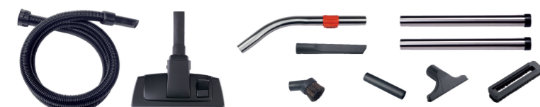
Comprehensive accessory kit