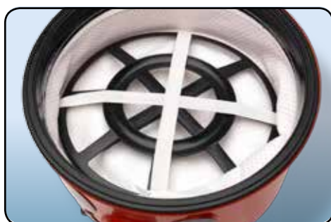
TriTex and HepaFlo high efficiency filtration system